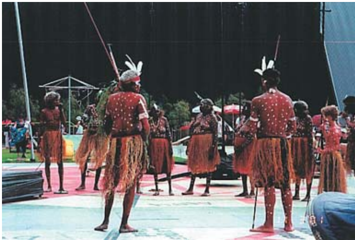
Wik Apalech Dancers at the Launch of the National Museum of Australia, Canberra, 2000. All rights reserved

The second criterion is that a work must be reduced to material form. Copyright cannot subsist in a spectacle or performance. 26 There is a clear requirement of fixation in Australian law before copyright vests in a dance. Indigenous dance is transmitted via oral means, and learned through performances. Unless the dance was recorded in material form, by way of film or notation, then the requirement of material form will not be satisfied.