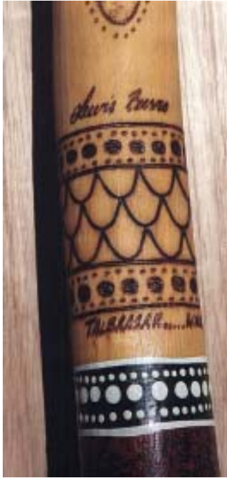
Didgeridoo design by Lewis Burns. All rights reserved

One item found on the design register, was a hand-painted didgeridoo. The statement of monopoly rights in the didgeridoo relates to the pattern and ornamentation applied to the surface of the didgeridoo. The act of registration does not preclude other people from designing or registering didgeridoos with different patterns or ornamentation applied to them.